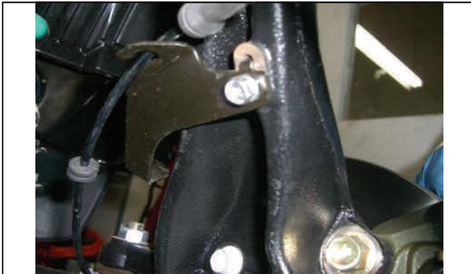
Disconnect ABS line bracket behind spindle