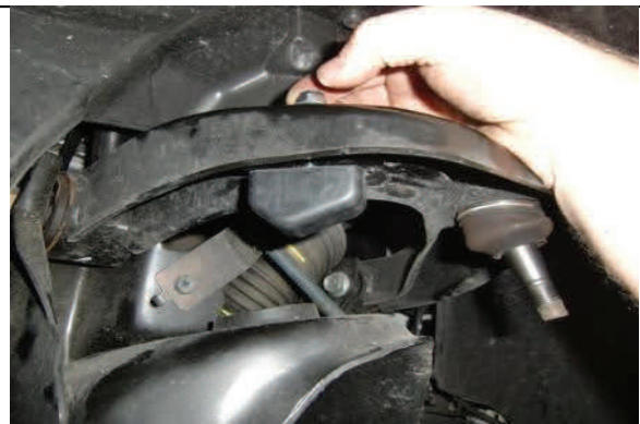
Attach bump stop as shown, note bumpstop orientation