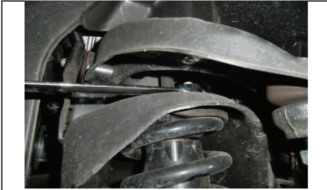
Remove upper strut mounting hardware