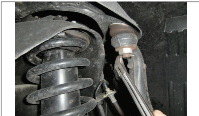
Remove cotter pin and upper ball joint