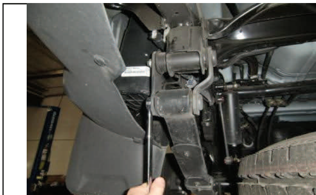
Unbolt the upper/lower shackle hardware