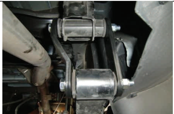
Tighten new hardware

Raise axle and reattach lower shock bolts and ABS/lines to axle. Reconnect exhaust hanger bracket to frame. Recheck all work performed. Raise spare tire into original position.