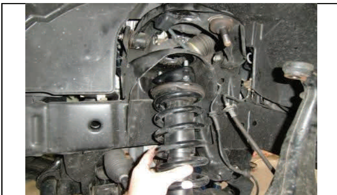
Reinstall strut assembly into vehicle w/ new upper hardware

Reattach lower shock mounting hardware. Raise lower control arm and reconnect upper ball joint to upper control arm. It will be necessary to use a pry bar and some force; the upper control will be contacting the frame when assembled at full droop. Reattach sway bar endlinks and ABS line brackets and tighten all hardware. This kit also comes with alignment bolts and shows their installation in the following steps.