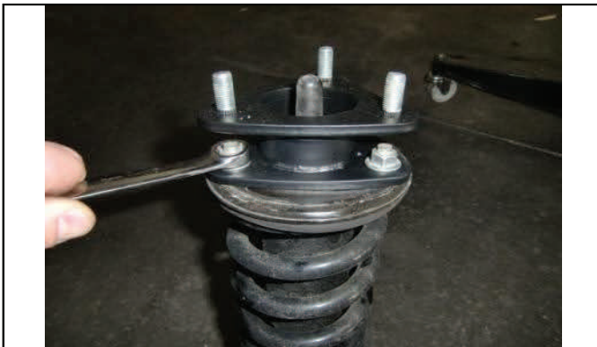
Attach strut extension with OE hardware