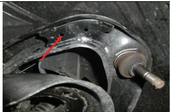
Drill 5/16 hole in upper control arm existing hole in as shown