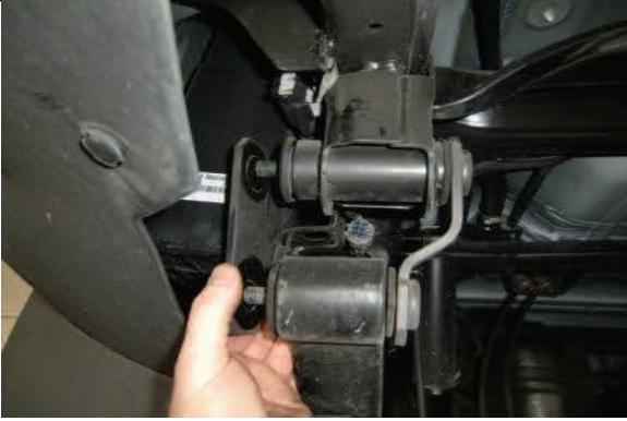
Remove outside shackle plate