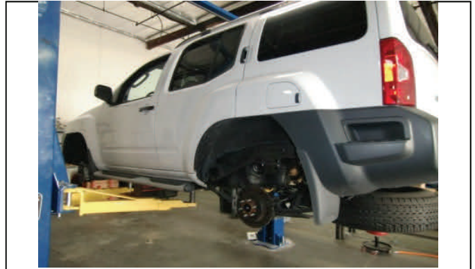
Raise and support vehicle by frame