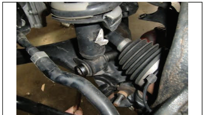
Remove lower shock mounting hardware