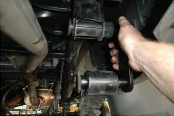
Lower axle and install new shackle bracket