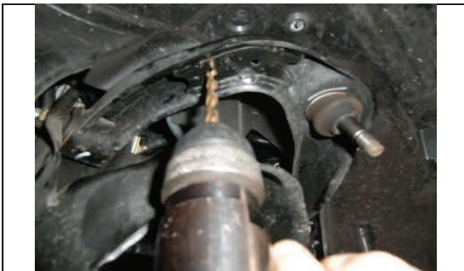
Photo shows drilling hole