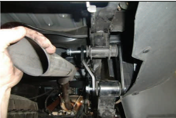
On passenger side, pull down on exhaust to gain access