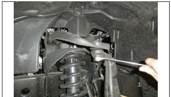
Loosen upper ball joint nut, do not remove