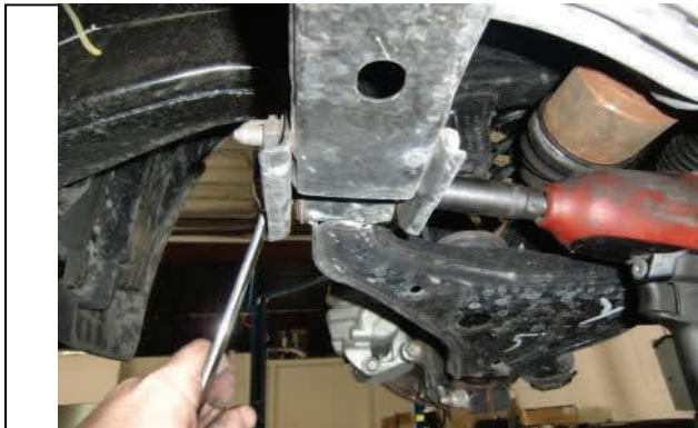
Loosen the lower control arm mounting hardware