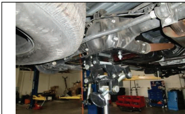
Support rear axle