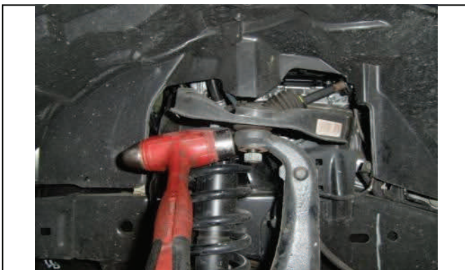
Strike spindle to break loose connection