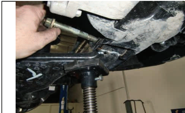
Support lower control arm, remove/replace bolts one at a time