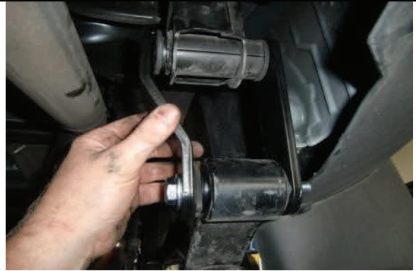
Attach new inner brackets and hardware