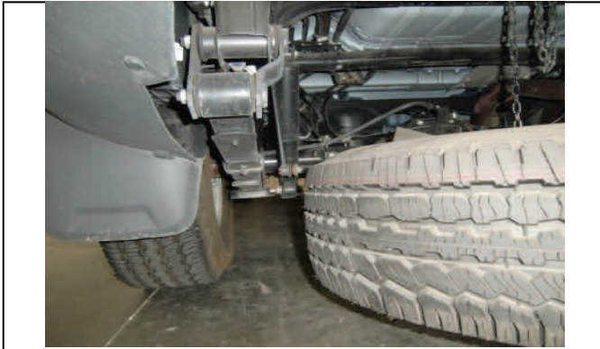
Lower spare tire below rear shackles