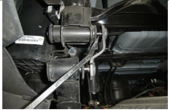
Pry out the inner shackle mounting bracket