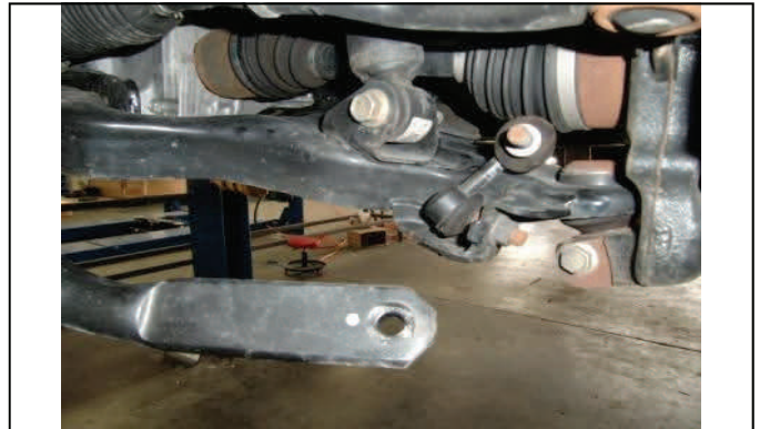
Disconnect sway bar end links