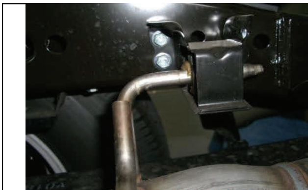
Unbolt rearmost exhaust hanger on frame