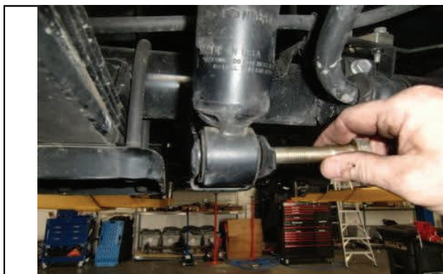
Remove lower shock mounting hardware