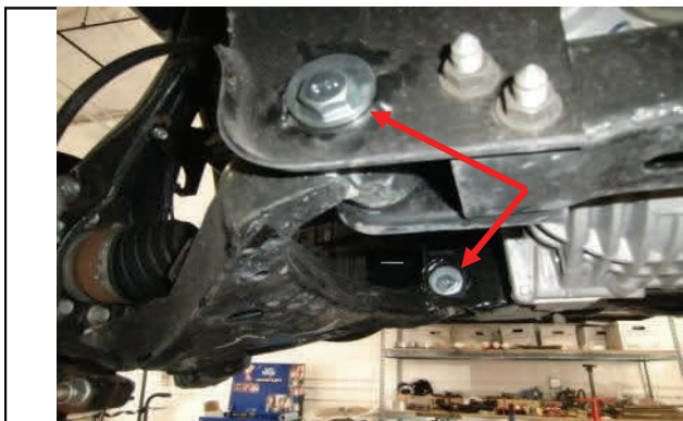
Orient cams in the upright/neutral position and tighten