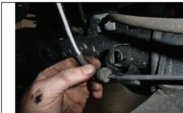
Remove ABS lines from attachments on axle