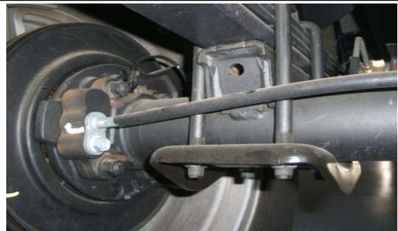
24. Support the rear axle, then remove the u-bolts and hardware.