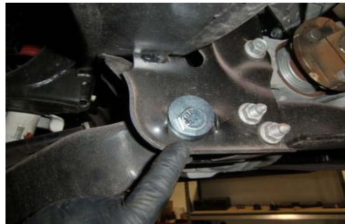
12. Install the provided alignment cam bolts as shown.