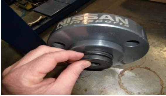
21. Install the new center sleeve with the OE bushings as shown.