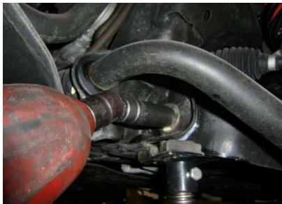
11. Remove the lower control arm bolts one at a time, to allow for installation of alignment cams.