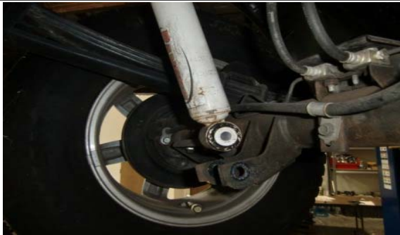
23. Disconnect the rear shock hardware and remove from the vehicle.