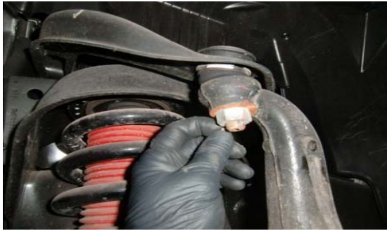
7. Remove the cotter pin from the upper control arm ball joint.