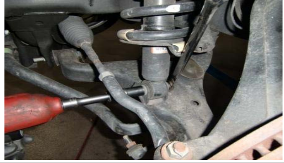
6. Remove the nut and bolt from the lower strut mount.