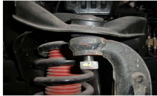
8. Loosen the upper ball joint nut, do not remove.