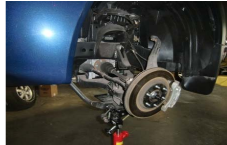
10. With the lower control arm supported, disconnect the upper control arm from the spindle, then carefully lower the jack to drop the suspension. Remove the strut from the vehicle.