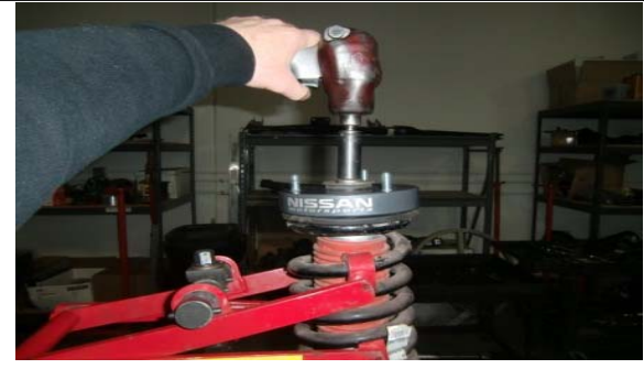
24. Tighten the OE hardware to spec.