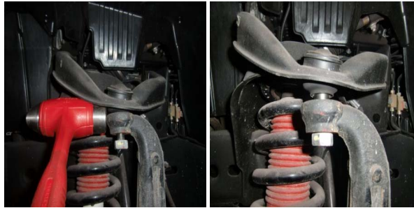
9. Separate the upper ball joint from the spindle. A hammer may be necessary.