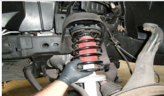
25. Re-assemble the coil-over and reinstall in the vehicle.