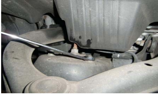
5. Remove the three upper strut nuts.