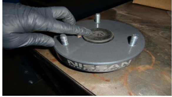
22. Insert the sleeve through the top and bottom bushings.