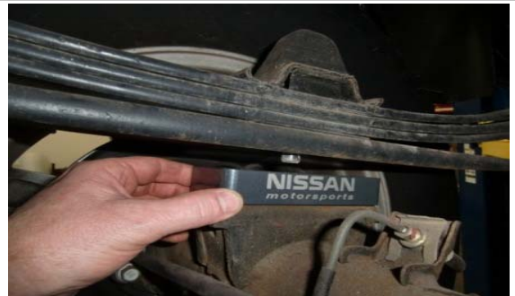
26. Lower the axle and install the lift block into position.