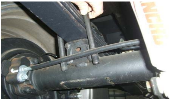
25. Remove the OE u-bolts, hardware and mounting plate.