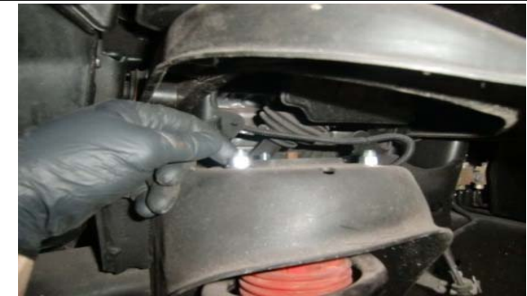
26. Install the upper strut with provided nuts.