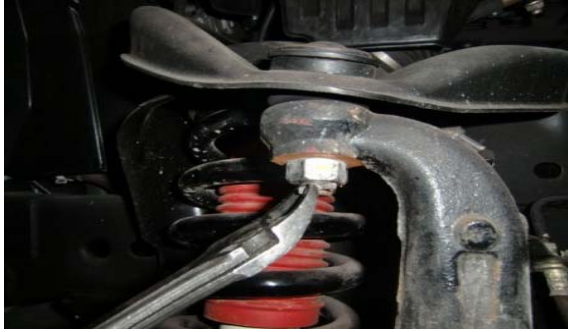
21. Install the new provided cotter pin.

Repeat these steps on the opposite side of the vehicle.