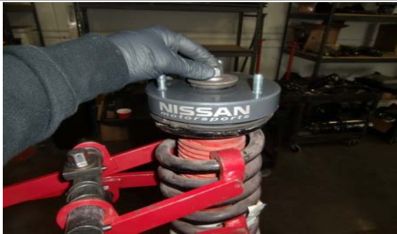
23. Reinstall the upper assembly back on top of the strut.