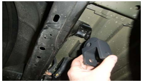
28. Install the provided shock extensions with the OE hardware.