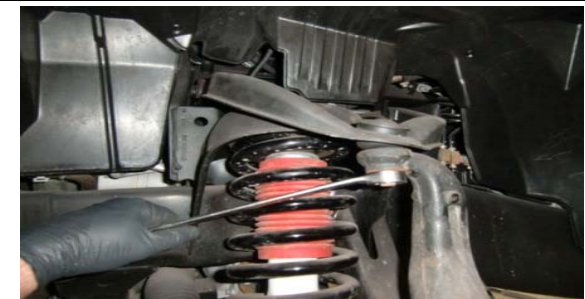
28. Raise the suspension and reattach the upper control arm to the spindle using the OE hardware.