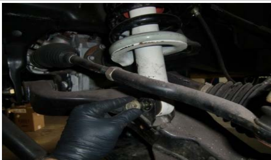
27. Reinstall the lower strut to the lower control arm with OE hardware.