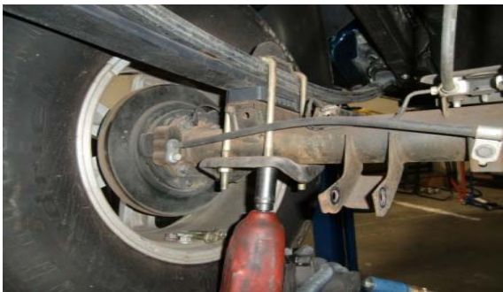
27. Install the new u-bolts, hardware, and OE mounting plate.