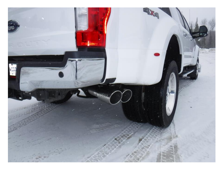
Congratulations! You are ready to begin experiencing the improved power, sound and driving experience of your MBRP Inc. performance exhaust system. We know you will enjoy your purchase.

8. Check along the entire length of the exhaust system to ensure that there is adequate clearance between the exhaust system and heat shields, cross members, driveline, and body panels. Adjust the system if required.