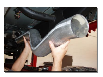
Figure 2 require cutting to fit Crew Cab trucks. For extended cab trucks, approximately 9½" needs to be cut off the straight section of pipe. (Installation tip: Temporarily hang the Mid Pipe and Muffler and the

Tail Pipe in place and measure to the four-bolt flange to verify the length required).