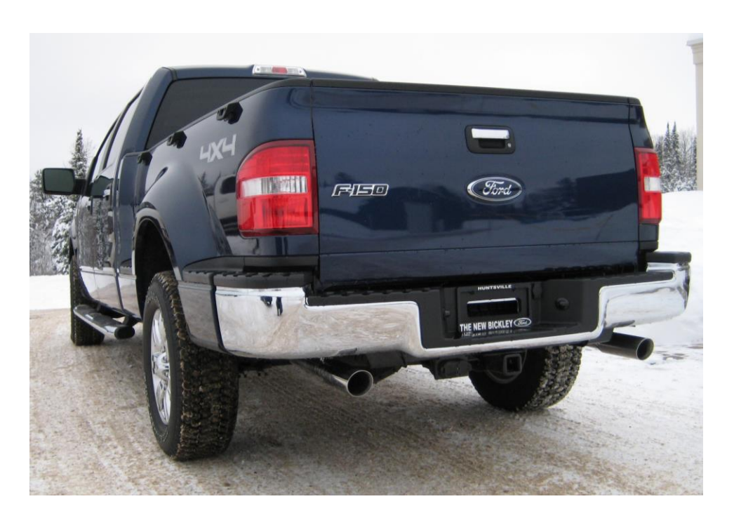
Congratulations! You are ready to begin experiencing the improved power, sound and driving excitement of your MBRP Inc. performance exhaust system. We know you will enjoy your purchase.