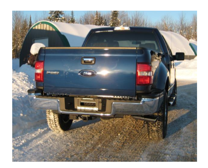
Congratulations! You are ready to begin experiencing the improved power, sound and driving excitement of your MBRP performance exhaust system. We know you will enjoy your purchase.