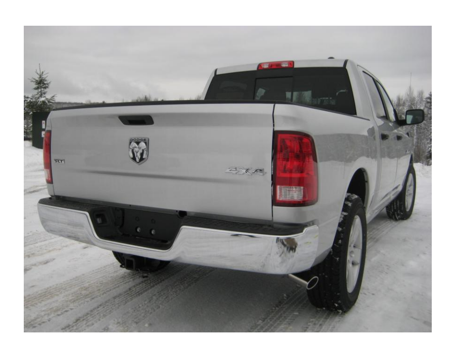
Congratulations! You are ready to begin experiencing the improved power, sound and driving experience of your MBRP Inc. performance exhaust system. We know you will enjoy your purchase.