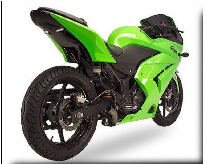
11. Your Done!