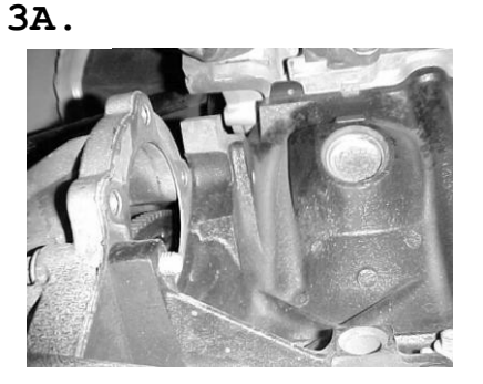
REMOVE THE MANIFOLDS ATTACHING STUDS.

BOLTS NEEDED TO BE REMOVED FOR REMOVAL OF THE STARTER.