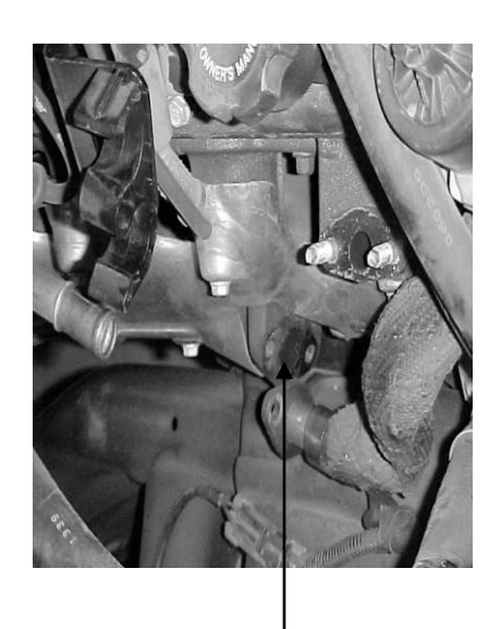
EGR TUBE FITTING