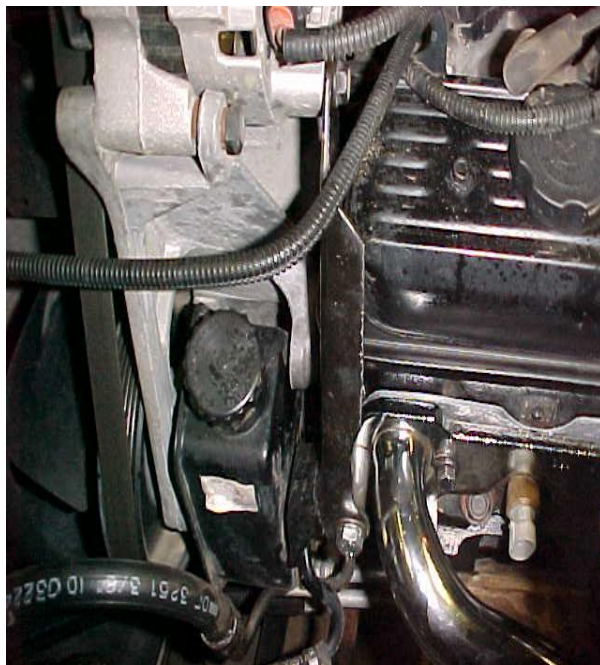
THIS IS A VIEW OF THE MODIFIED BLACK STEEL BRACKET INSTALLED.

10) TO REINSTALL WIRELOOMS, USE SUPPLIED 1/2" TUBULAR SPACE AND 1/4" BOLT. THE SPARK PLUG LOOM WILL NOW SIT OUTWARD OF THE HEADER FLANGE RATHER THAN AGAINST THE HEAD. IF EQUIPPED, RE-INSTALL THE O2 SENSOR. (REFER TO PICTURE ABOVE FOR A VISUAL OF WHERE THE WIRELOOM INSTALLS AT.)