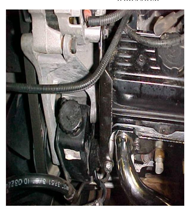
THIS IS A VIEW OF THE MODIFIED BLACK STEEL BRACKET INSTALLED.

11) RE-INSTALL THE MODIFIED BLACK STEEL BRACKET IN REVERSE ORDER OF REMOVAL.IF YOU CHOSE TO CUT THE BRACKET OFF BETWEEN THE POWER STEERING PUMP AND MANIFOLD THAN YOU MUST REATTACH THE BRACKET TO THE ALTERNATOR AND THE HEADER. AFTER REATTACHING THE BRACKET YOU MUST WELD THE BRACKET BACK ONTO THE PIECE OF BRACKET STILL ATTACHED TO THE POWER STEERING PUMP. IF YOU CHOSE THE OTHER WAY THAN YOU MUST FASTEN BRACKET TO THE REAR OF THE POWER STEERING PUMP. MANEUVER THE POWER STEERING PUMP BACK INTO ITS ORIGINAL POSITION. THE STEEL BRACKET WILL NOW ATTACH TO THE HEAD WITH THE SINGLE STUD IN THE FRONT HOLE OF THE NUMBER ONE PORT.ATTACH THE STEEL BRACKET TO THE BACK OF THE ALTERNATOR. INSTALL THE THREE BOLTS BACK THROUGH THE FRONT OF THE POWER STEERING PUMP. RE-INSTALL THE PULLEY.(THREAD THE MANDREL INTO THE PUMP SHAFT. THEN PRESS THE PULLEYBACK ONTO THE PUMP SHAFT.) RE-INSTALL SERPENTINE BELT.RE-INSTALL FAN SHROUD.