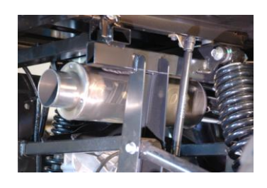
6. Now install factory heat shield back onto the vehicle and attach bed assembly.