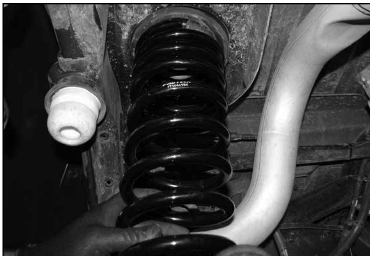
FIGURE 2 - STEP 11