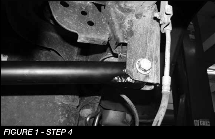
FIGURE 1 - STEP 4