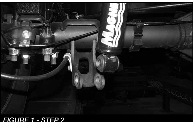
FIGURE 1 - STEP 2

3. Locate (FT20690BK)rear shock extension and factory bolt. Install the new bracket on the rear shock. Torgue to 160 ft-lbs. SEE FIGURE 2