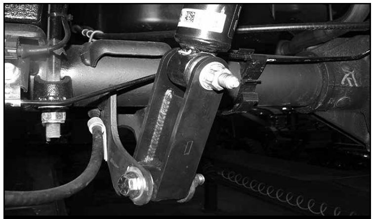
FIGURE 3 - STEP 4

4. Locate the supplied 1/2" hardware. Rotate the shock 90 degrees and install the new bracket to the factory lower shock mount. Torque to 127 ft-lbs. SEE FIGURE 3