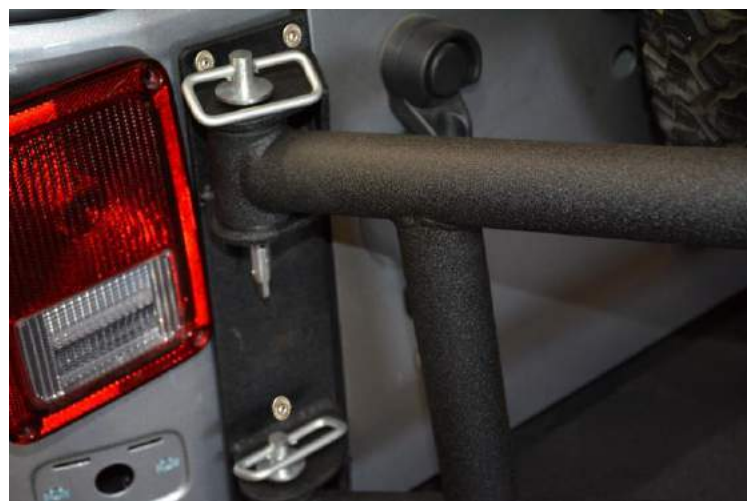
Step 20: Remove the quick release pins and pull the tire carrier to the open position. The body mounting bracket should be securely mounted to the body. Mark the last two mounting holes that were covered by the tire carrier when closed. Use center punch and hammer and lightly punch the center of your mark, drill pilot holes with 1/8" drill bit and then drill to final size with 5/16" drill bit.