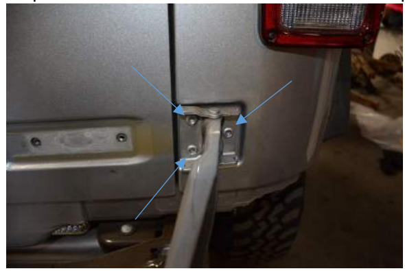
Step 4: On the bottom of the hinge grind the hinge pin smooth with the hinge using a grinder.