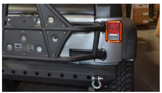
Step 13: Install tire stud and license plate holder with the six 12 mm bolts provided.