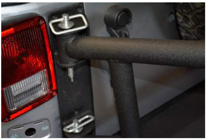
Step 17: With the tire carrier in the closed position and the new body bracket touching the rear body panel take a marker and mark the 5 mounting hole locations.

Step 18: Use a center punch and hammer and lightly punch the center of your mounting marks, so that your drill bit won't walk when are drilling the pilot hole. Use a 1/8" drill bit to drill your pilot holes first for the rear mounting bracket. Once you have drilled the 5 pilot holes go back with a 5/16" drill bit and finish drilling mounting holes to the correct size. (note: some holes you will be drilling through 2 layers of sheet metal.)