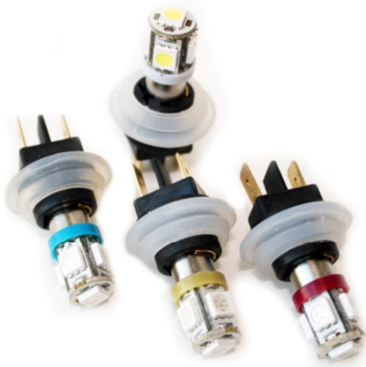
LED BULBS: WHITE, AMBER, BLUE AND RED