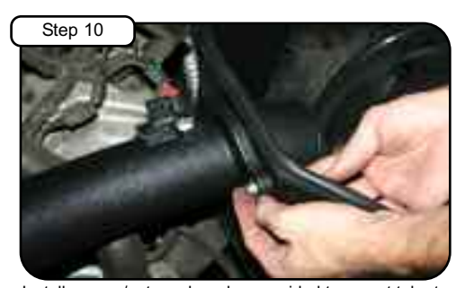
Install screws/nuts and washer provided to mount tube to housing. Tighten using 10mm socket or wrench.