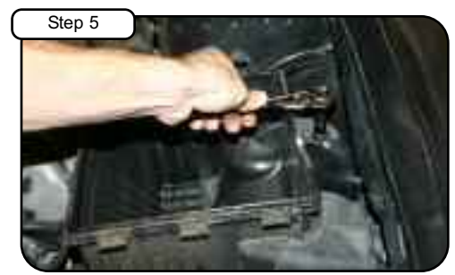
With 10mm socket or wrench loosen the 2 screws holding in OE air box. Lift up and remove OE air box out of vehicle.