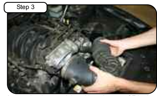
Loosen the clamp at air box side and remove OE intake tube.