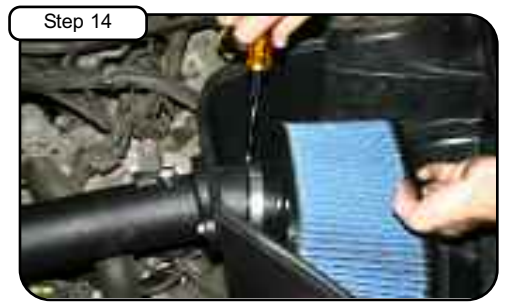
Install air filter and tighten using 5/16" nut driver.