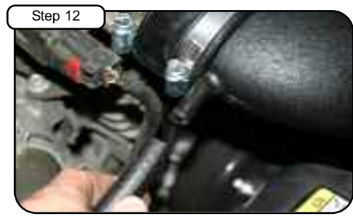
Install new 3/8" provided to valve cover side and new tube