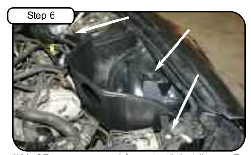
With OE screws removed from step 5, install new aFe housing to vehicle. Tighten using 10mm socket or wrench.