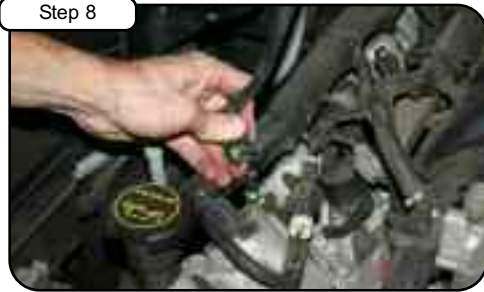
Remove factory crank case line from engine.