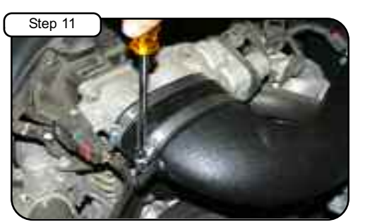
Tighten clamps with 5/16" nut driver.