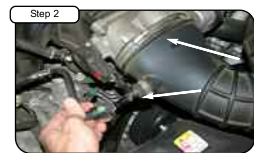
With 5/16" nut driver loosen clamp at throttle body. Disconnect and remove OE crank case line.