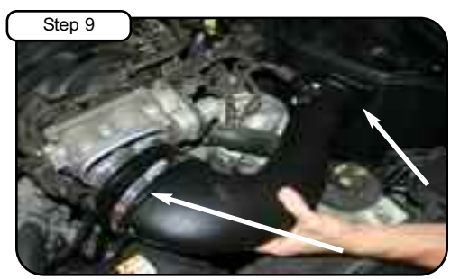
Install coupler with clamps to tube. Install tube to outside of housing and position coupler on to throttle body.