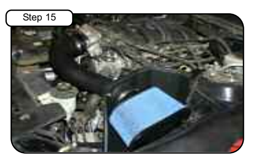
Your installation is now complete. Please check all bolts and clamps perodically. Re-tighten if necessary. Thank you for choosing aFe! Place enclosed CARB EO sticker on a clean/smooth surface on or near the device. EO identification label is required in passing the smog check inspection.