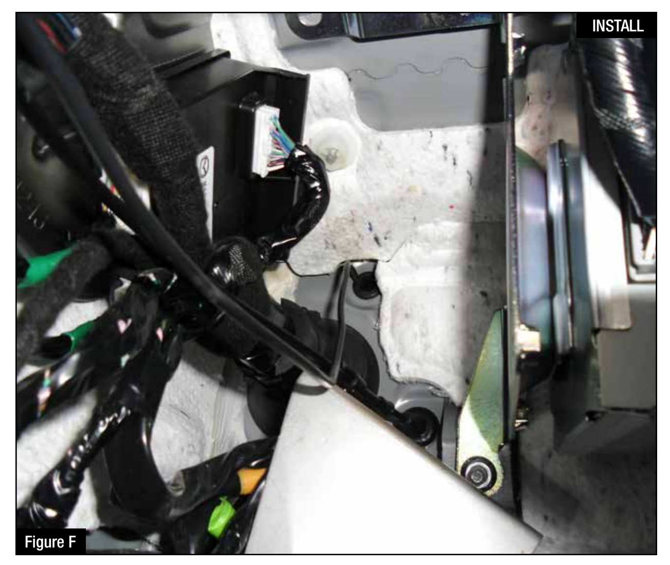
Refer to Figure F for Step 9.