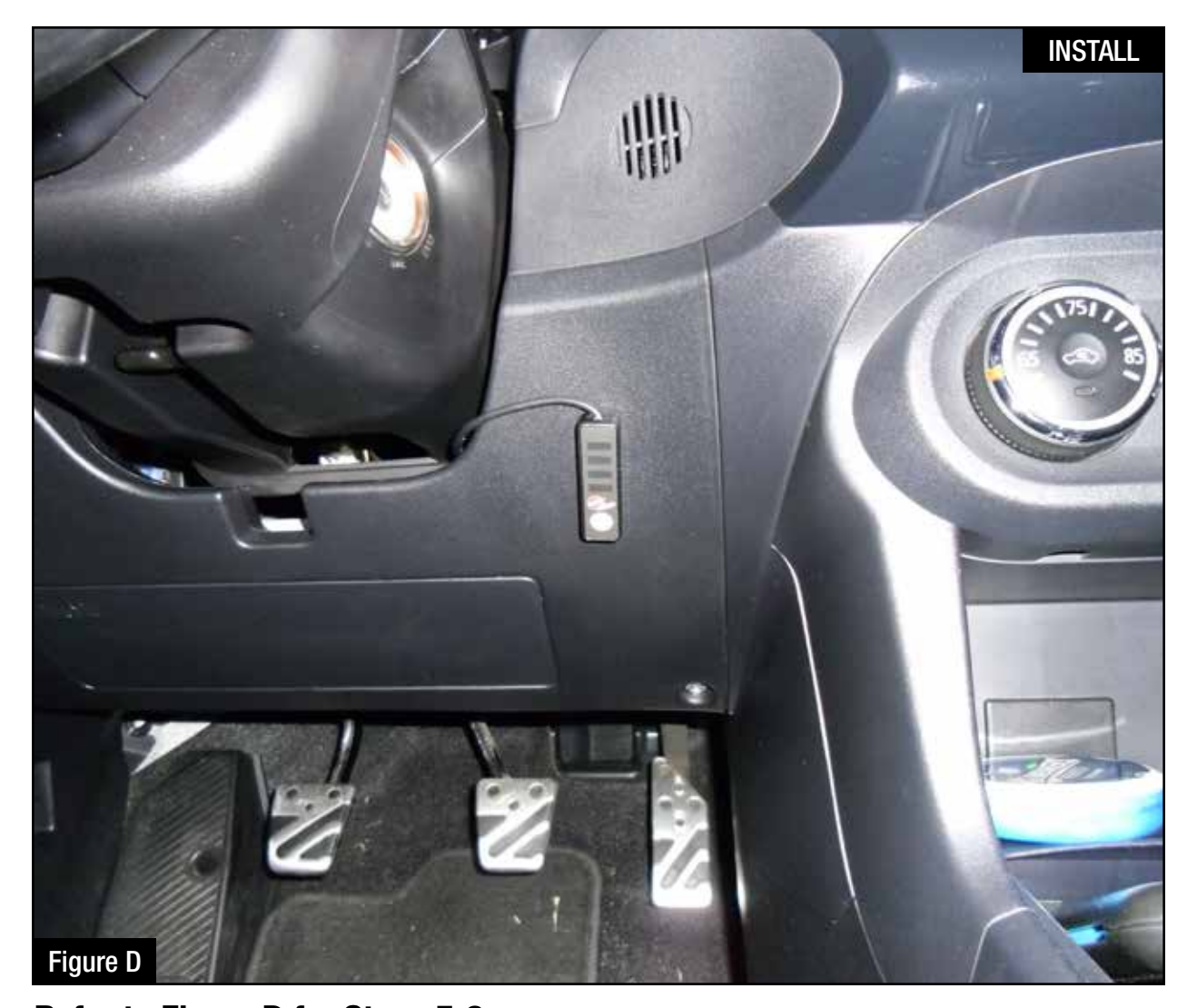
Refer to Figure D for Steps 7-8.

Step 7: Carefully route the switch cable behind steering wheel cover.