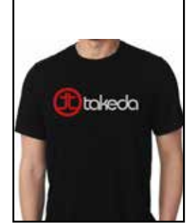
P/N: 40-30331 (S) 40-30332 (M) 40-30333 (L) 40-30334 (XL)