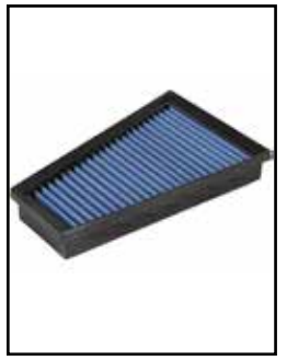
P/N: 30-10240 (P5R) 31-10240 (PDS)