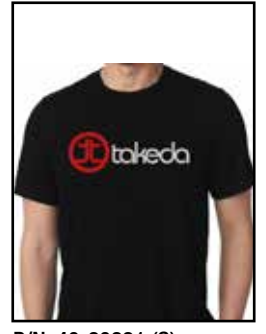
P/N: 40-30331 (S) 40-30332 (M) 40-30333 (L) 40-30334 (XL)