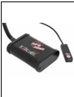
P/N: 77-46321 (Sensor 2)