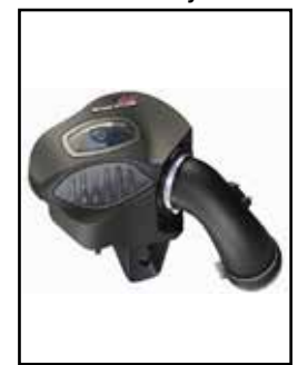
P/N: 54-76309 (P5R) 51-76309 (PDS)