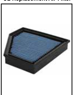
P/N: 30-10270 (P5R) 31-10270 (PDS)