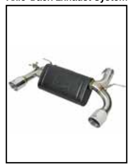
P/N: 49-36335-B (Blk Tips) 49-36335-P (Pol Tips)