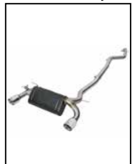
P/N: 49-36334-B (Blk Tips) 49-36334-P (Pol Tips)