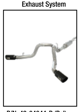
P/N: 49-04044-P (Pol) 49-04044-B (Blk) Exhaust Race Pipe