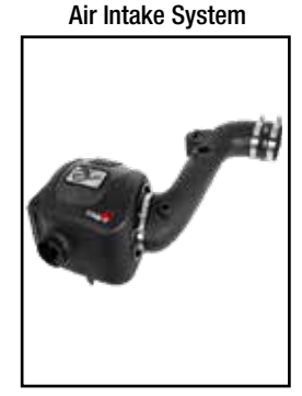
P/N: 51-82322 (PDS) 75-82322 (PG7)