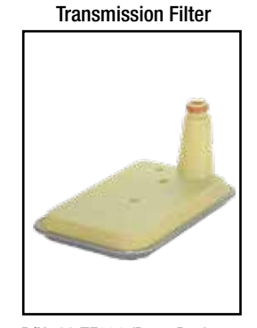
P/N: 44-TF006 (Deep Pan) 44-TF009 (Shallow Pan) OER Air Filter