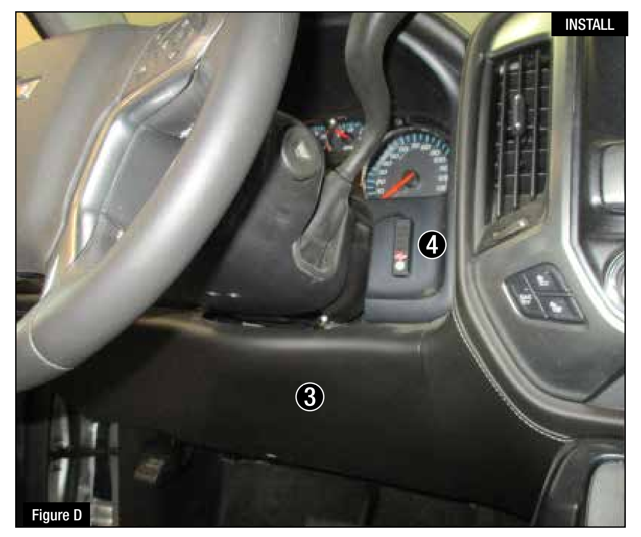
Refer to Figure D for Step 7.