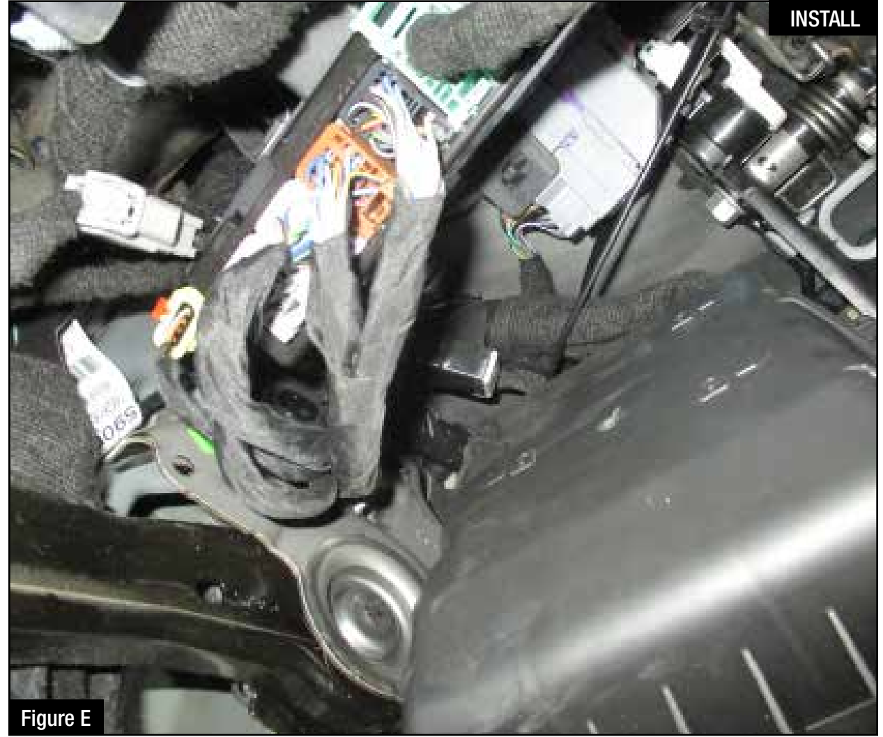
Refer to Figure E for Step 8.

Step 8: Route the switch cable through firewall and into the engine bay. Follow the main harness through the grommet into the firewall. Plug the end of the cable to the module.