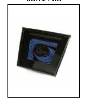
P/N: 30-80209 (P5R) 31-80209 (PDS) 73-80209 (PG7)