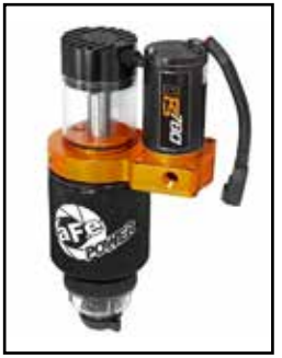
P/N: 42-12035 (Full-time) 42-12036 (Boost Act.)