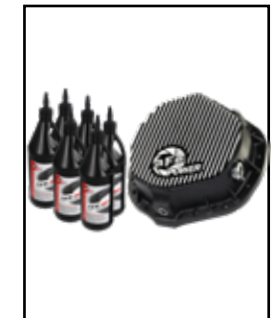
P/N: 46-70012-WL (w/ 0il) 46-70012 (Blk) 46-70010 (RAW)