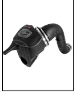
P/N: 50-72005 (P10R) 51-72005 (PDS) 75-72005 (PG7)