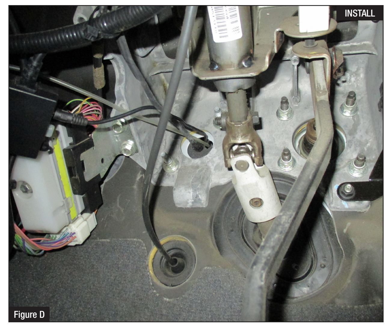
Refer to Figure D for Step 6.

Step 6: Route the switch cable through firewall and into the engine bay. Follow the main harness through the grommet into the firewall. Plug the end of the cable to the module.