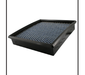
P/N: 30-10011 (P5R) 31-10011 (PDS) 73-10011 (PG7)