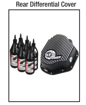
P/N: 46-70032-WL (w/ 0il) 46-70032 (Blk) 46-70030 (RAW)