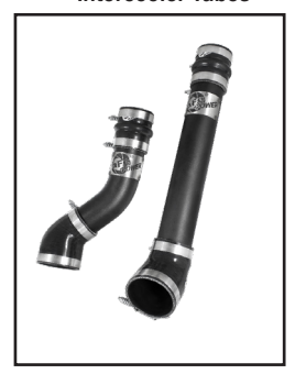
P/N: 46-20064-B (Black) 46-20064-R (Red)