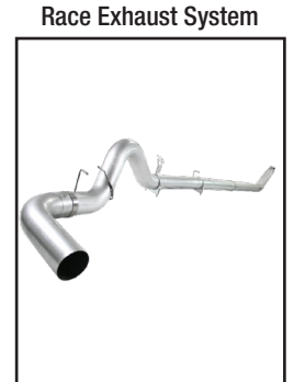
P/N: 49-02033 (No Muffler)