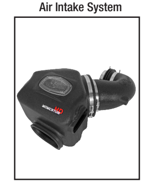
P/N: 51-72001 (PDS) 75-72001 (PG7)