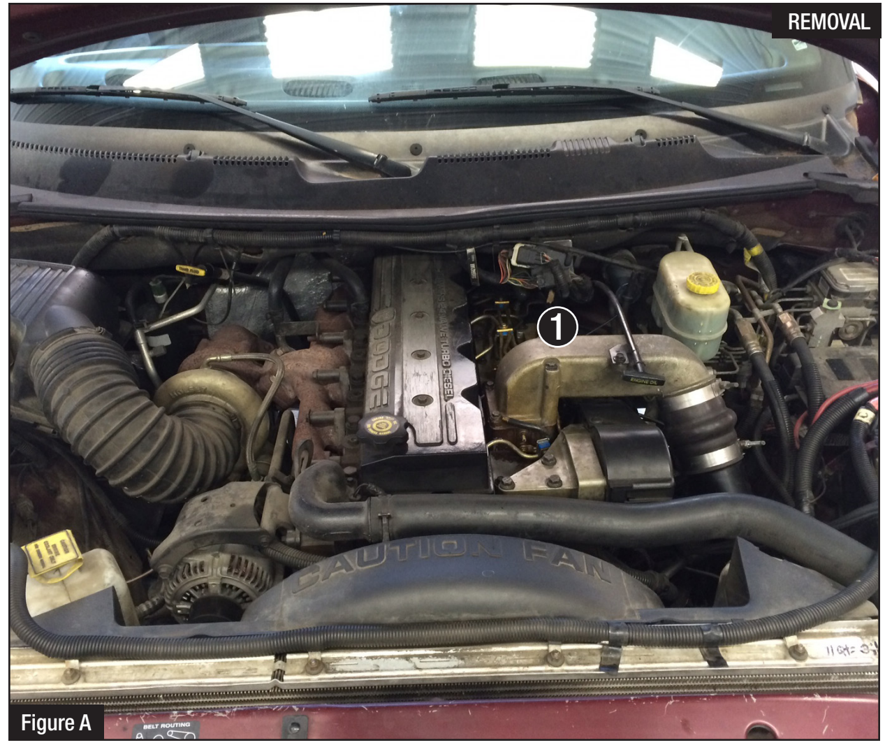
Refer to Figure A for Step 1.

Step 1: Locate the Injection pump (1) on the driver side of the engine under the intake manifold.