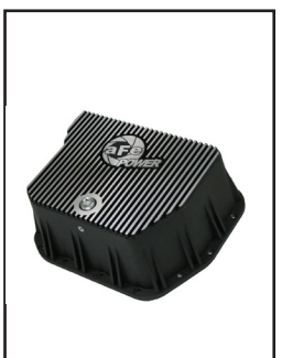
P/N: 46-70052 (Machined) 46-70051 (All Black)