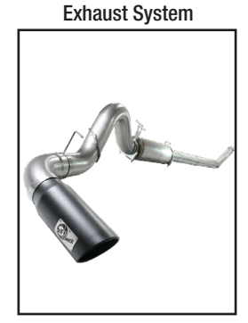
P/N: 49-42033-B (Blk Tip) 49-42033-P (Pol Tip)