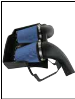
Stage-2 Intake System