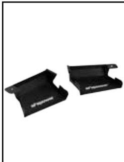
Dynamic Air Scoop

P/N: 54-11478 (Black) 54-11478-L (Blue) 54-11478-R (Red)