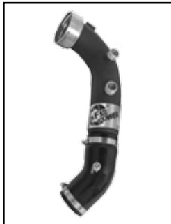
Cold Side Intercooler Tube

P/N: 54-11478 (Black) 54-11478-L (Blue) 54-11478-R (Red)