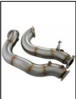
Twisted Steel Downpipes