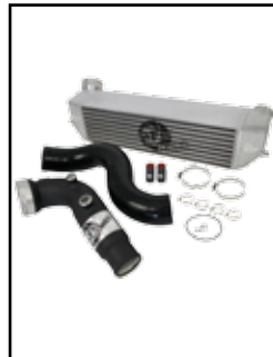
Intercooler w/ Tube