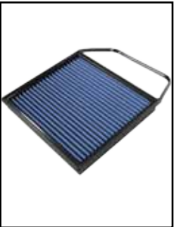
OE Replacement Filter

P/N: 49-36327-B (Blk. Tips) 49-36327-P (Pol. Tips)