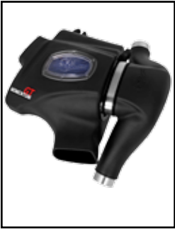
Momentum Intake System