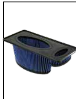
OER Air Filter

P/N: 10-10107 (P5R) 11-10107 (PDS) 71-10107 (PG7)