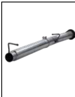
Exhaust Race Pipe