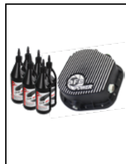
Rear Differential Cover

P/N: 46-70022-WL (w/ Oil) 46-70022 (Blk) 46-70020 (RAW)