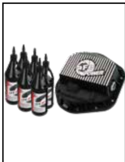
Front Differential Cover

P/N: 46-70082-WL (w/ Oil) 46-70082 (Blk) 46-70080 (RAW)