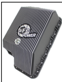
Transmission Pan Cover

P/N: 46-70082-WL (w/ Oil) 46-70082 (Blk) 46-70080 (RAW)