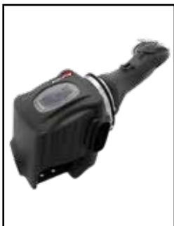
Air Intake System

P/N: 46-70022-WL (w/ Oil) 46-70022 (Blk) 46-70020 (RAW)