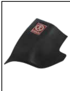
Intake System Cover