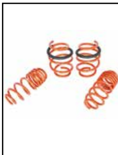
aFe Control Springs

P/N: 48-33024-HC (Street) 48-33024-HN (Race)