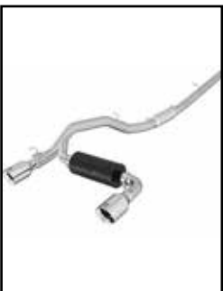
Cat-Back Exhaust System

P/N: 49-33103-P (Pol. Tips) 49-33103-B (Blk. Tips) 49-33103-L (Blue Tips)