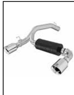
Axle-Back Exhaust System

P/N: 49-33104-P (Pol. Tips) 49-33104-B (Blk. Tips) 49-33104-L (Blue Tips)