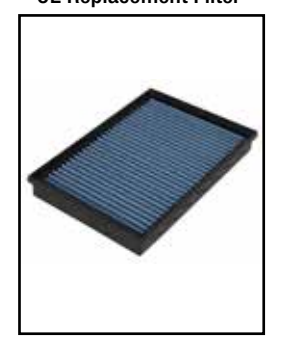
P/N: 30-10269 (P5R) 31-10269 (PDS)