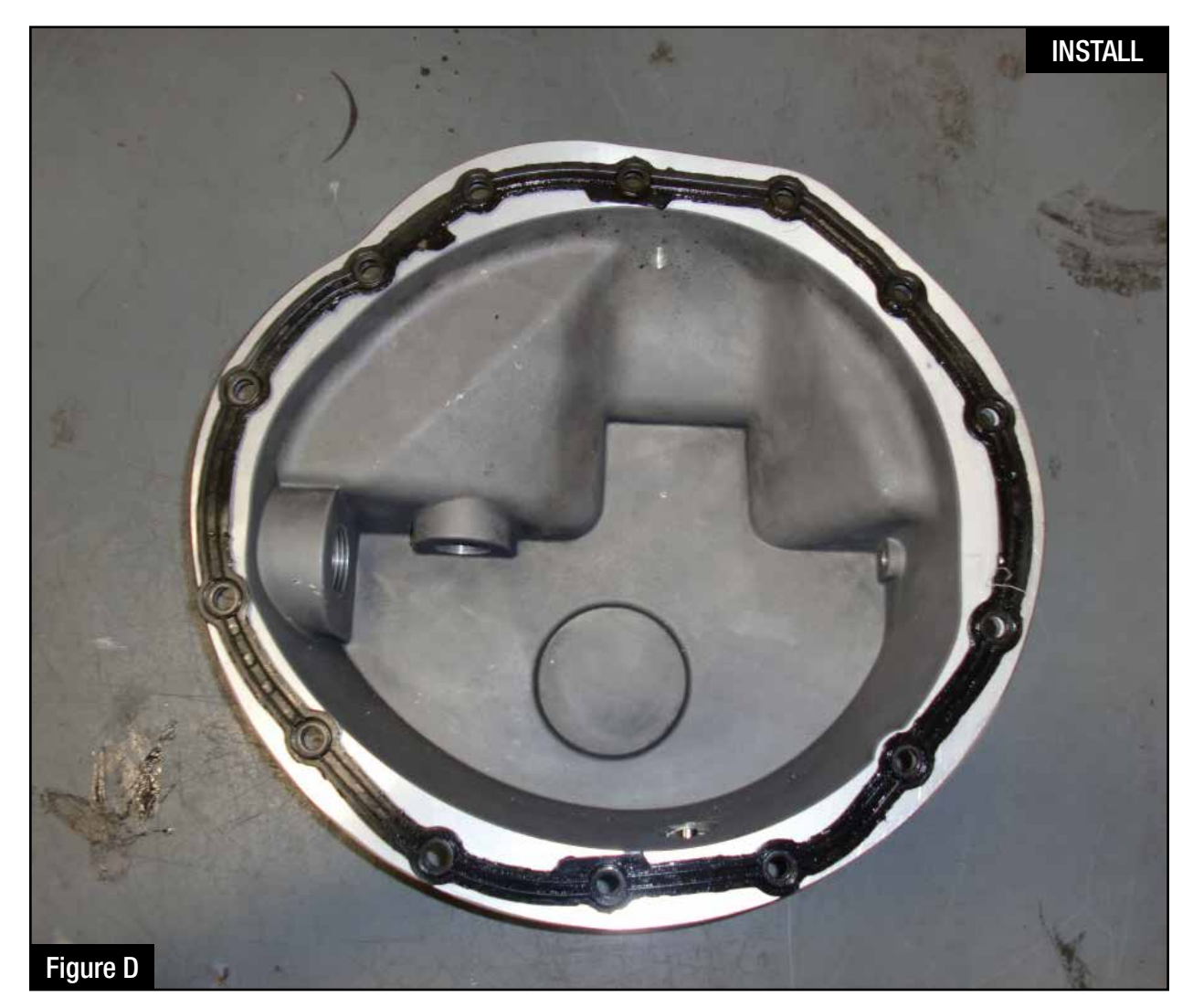
Refer to Figure D for step 11