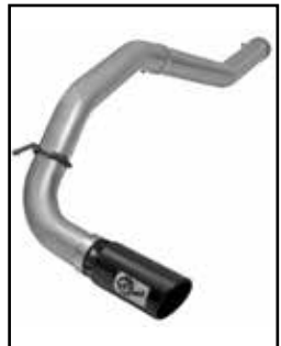
P/N: 49-46112-B (Blk. Tip) 49-46112-P (Pol.Tip)