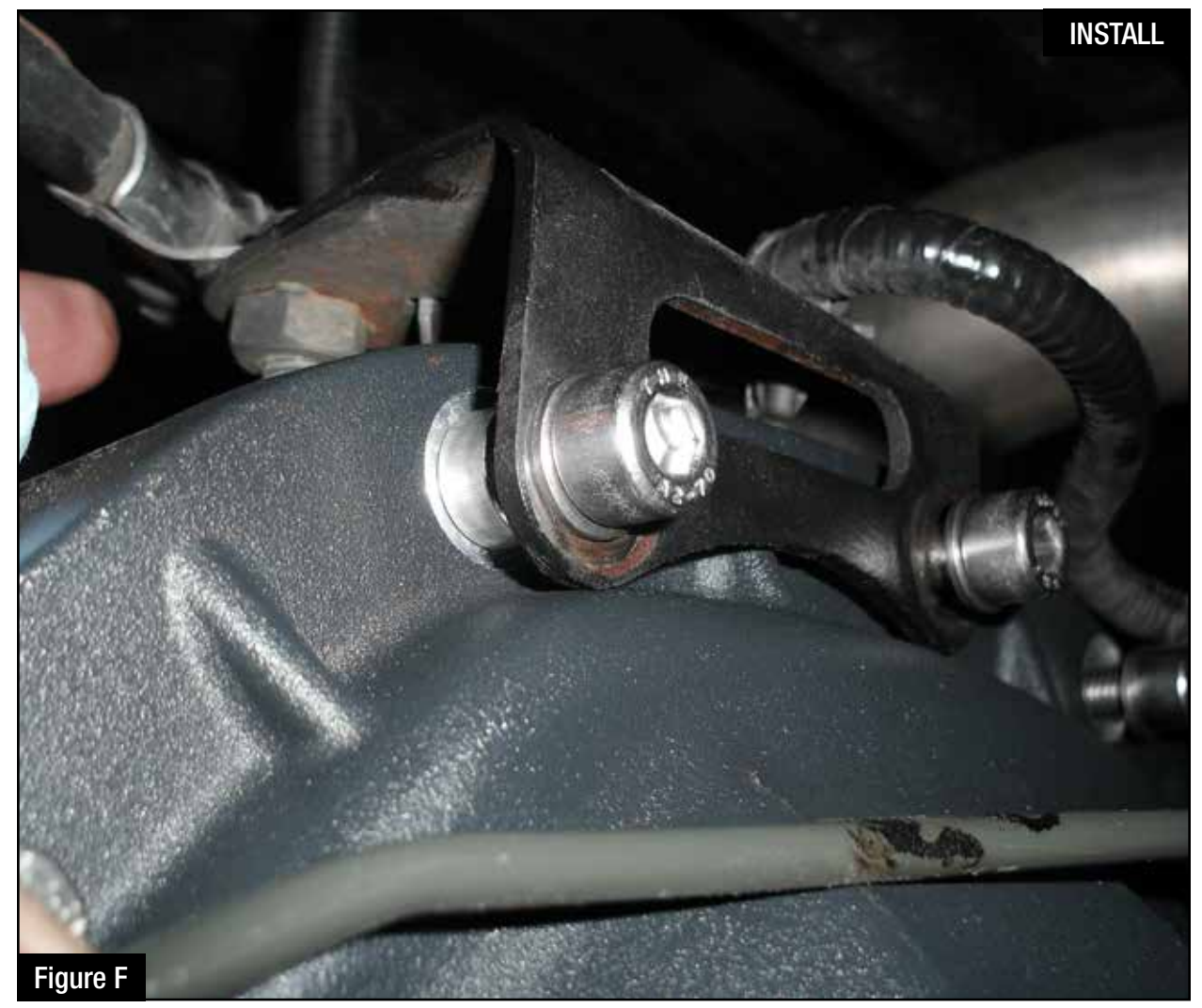
Refer to Figure F for steps 13-14

Step 13: Use the 40mm long shcs and spacers to secure the bracket at the top of the cover.