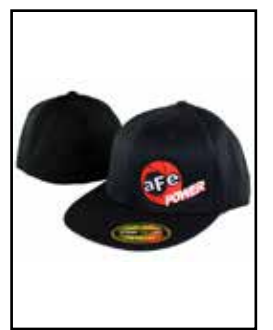
P/N: 40-10114 (S/M) P/N: 40-10115 (L/XL)