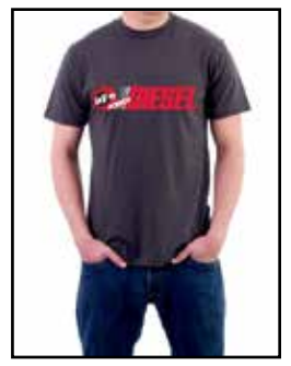
P/N: 40-30222-G (L) P/N: 40-30223-G (XL) P/N: 40-30223-G (2XL) P/N: 40-30223-G (3XL)