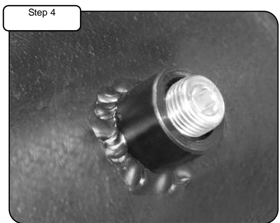
Install plugs in to 1/8" NPT ports with 3/16" hex key. Use teflon pipe sealant tape for leak tight fit.