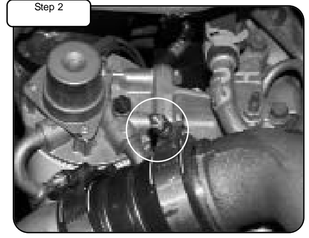
With 7/16" deep socket, loosen clamp on manifold.