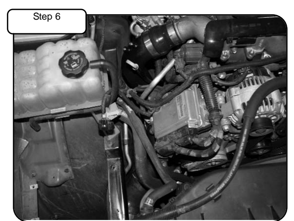
Install new tube and position into coupler on intercooler. Tighten and torque all clamps to 75 in-lbs.. Reinstall the air intake system and your intercooler tube installation is now complete. Thank you for choosing aFe power!

Place the included CARB EO sticker on or near the Intercooler Tube on a smooth, clean surface. EO identification label is required to pass the Smog Check Inspection.