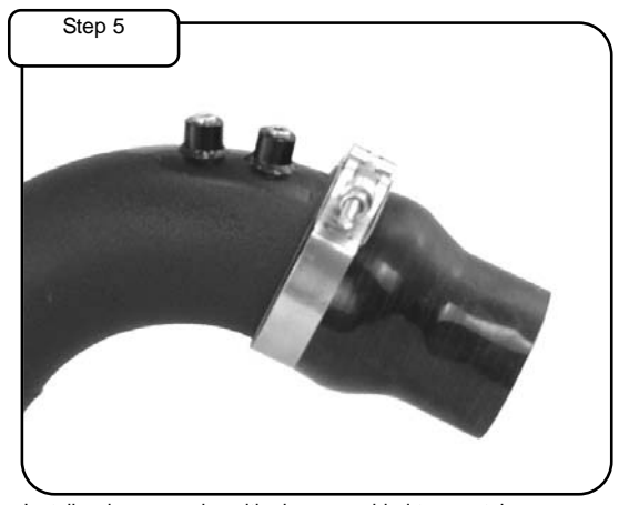
Install reducer coupler with clamp provided to new tube.