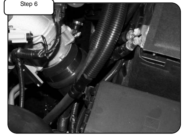
Install 3-1/2" hump coupler to manifold with clamps provided.

Install 3" hump coupler with clamps provided to new tube.