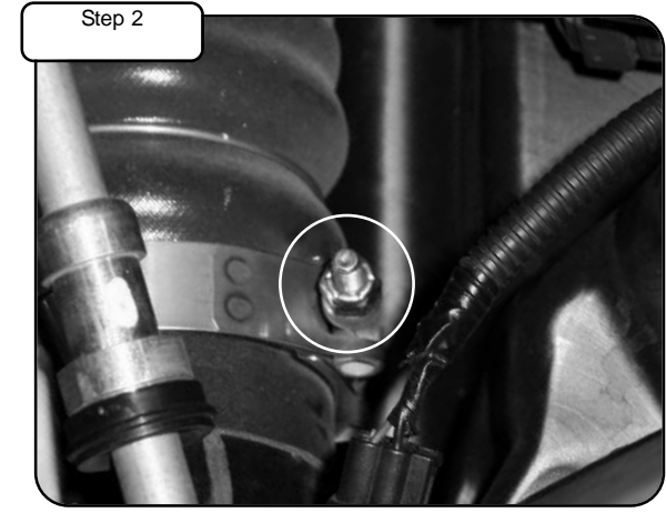
With 7/16" deep socket, loosen clamp on intercooler.