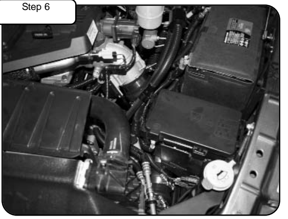
Install new tube and position into coupler on manifold. Tighten and torque all four clamps to 75 in-lbs. Check and tighten after 50 miles! Your Intercooler tube installation is now complete. Thank you for choosing aFe power!

Place the included CARB EO sticker on or near the Intercooler Tube on a smooth, clean surface. EO identification label is required to pass the Smog Check Inspection.