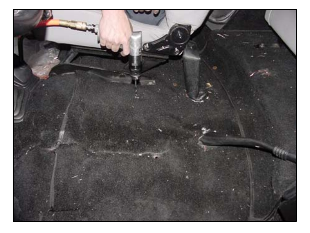
Figure 3 Figure 4