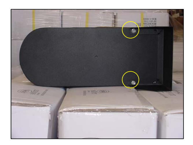
Figure 1 Figure 2