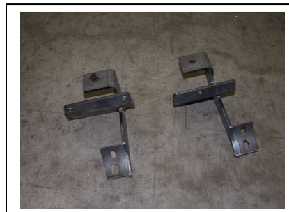
Fig 2 Driver side brackets

For Technical Support/Warranty Information please call 310-762-9944