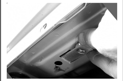
Fig 4 Driver side front shown