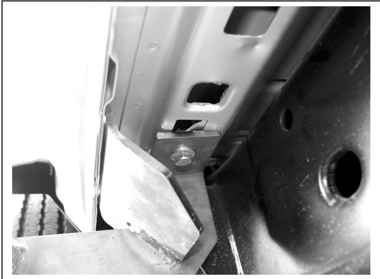
Fig 5 driver side front bracket shown