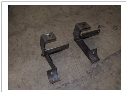
Fig 1 Passenger side brackets