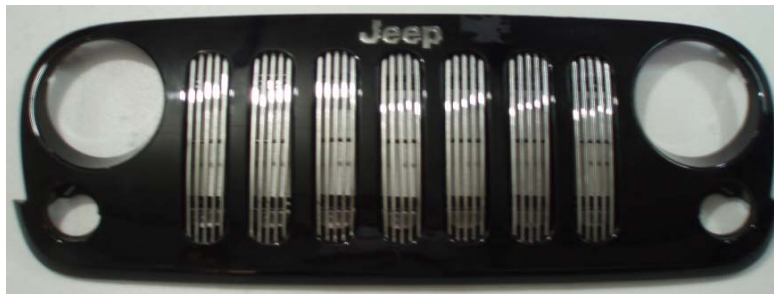
Figure 2 – Front View of positioning lower Billet Grille