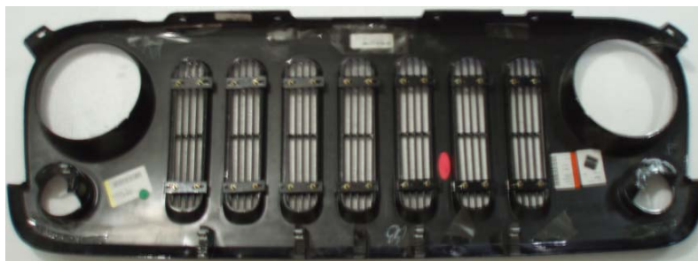
Figure 3 – Rear view of vehicle's shell; Billet Grills attached with Metal Brackets and Flange Nuts