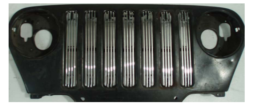
Figure 2 – Front View of positioning lower Billet Grille

3. Loosely attach the Billet Grille by holding the Metal Brackets behind factory grille shell and inserting the Phillips Screws (from the front) through the Billet Grille holes and Metal Brackets, secure them with Flange Nuts provided (Figure 3).