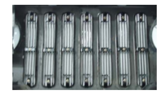
Figure 3 - Rear view of vehicle's shell; Billet Grills attached with Metal Brackets and Flange Nuts

3. Loosely attach the Billet Grille by holding the Metal Brackets behind factory grille shell and inserting the Phillips Screws (from the front) through the Billet Grille holes and Metal Brackets, secure them with Flange Nuts provided (Figure 3).