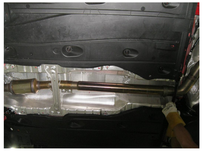
Step 2. Begin installing the new system by inserting the inlet of the Inlet Pipe into the OEM clamp at the catalytic converter. Leave clamp loose for final adjustment.