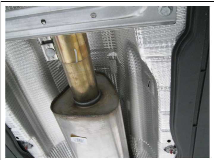
Step 1. Begin by loosening the factory clamp located just behind the catalytic converter. Working rearward extract the hangers from the rubber insulators (retain insulators as they will used in the installation of the new exhaust system). Remove the OEM system from the vehicle.