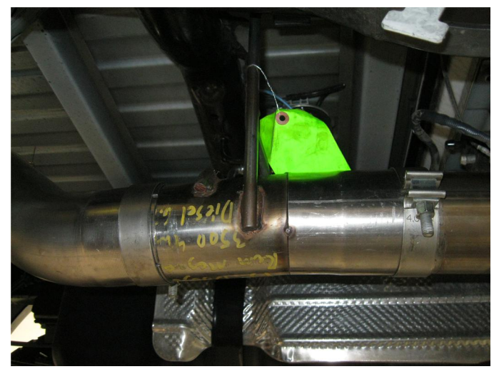
Step 5. The shorter Inlet Pipe [Item 1] will be needed for all 2013 and later Mega Cab applications only.

MAGNAFLOW: 1901 Corporate Centre Drive - Oceanside, CA 92056 | 1(800) 990-0905 Technical Support: 1(800) 959-9226 | Email: moreinfo@magnaflow.com