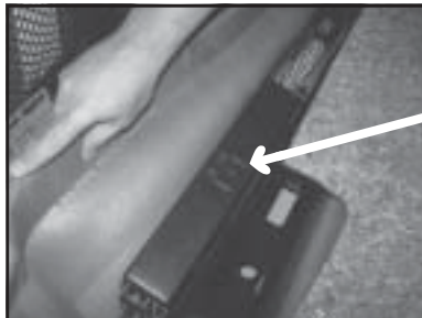
FUSE PANEL COVER PHOTO 2