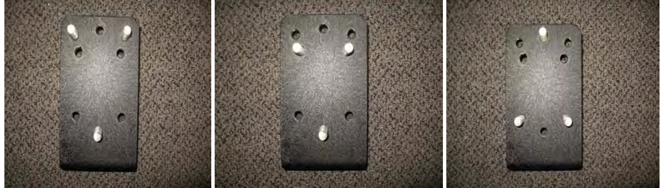
(41-86 CJ 5x5.5")

Step 1: Determine the correct lug bolt pattern you will need depending on the vehicle you have. (See Below)