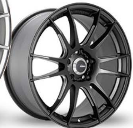
MATTE BLACK & BALL MILLED ACCENTS