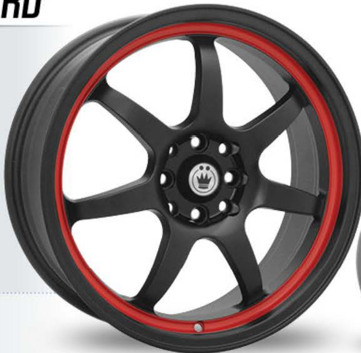
MATTE BLACK / RED STRIPE