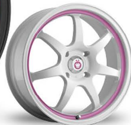
WHITE / PINK STRIPE