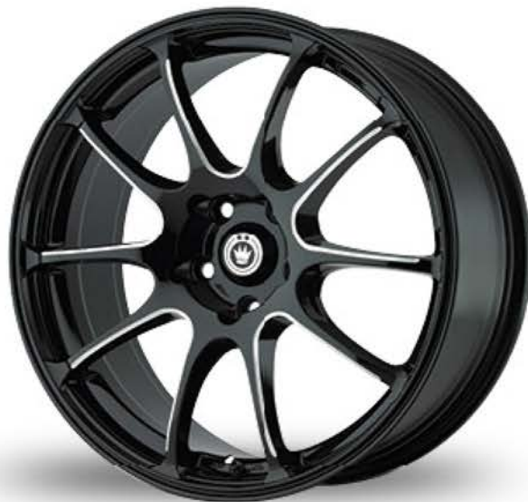
GLOSS BLACK / BALL CUT MACHINED SPOKES