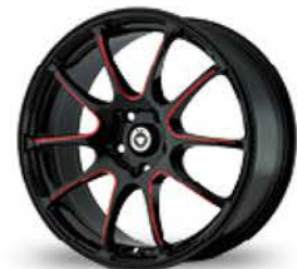
BLACK / RED BALL CUT