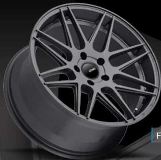
FINISHED FLOW FORMED WHEEL - KONIG INTEGRAM

THE FINAL PRODUCT IS LIGHTER, STRONGER, HAS INCREASED ELONGATION, AND GREATER SHOCK RESISTANCE