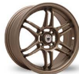
FULL MATTE BRONZE