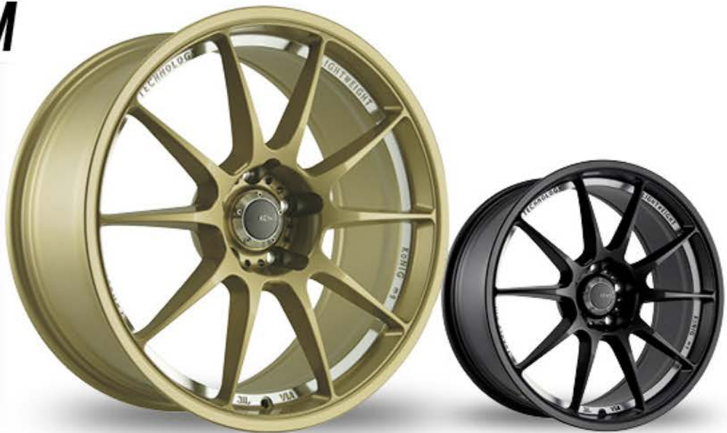
GOLD / MACHINED UNDERCUT