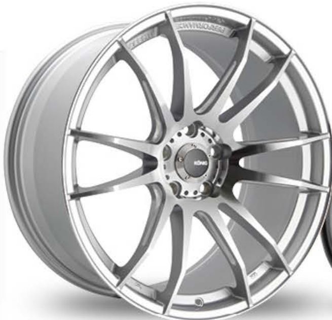
SILVER MACHINED FACE & BALL MILLED ACCENTS