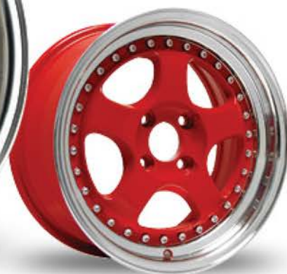
RED / MACHINED LIP