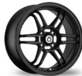
FULL MATTE BLACK