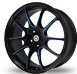
BLACK / BLUE BALL CUT