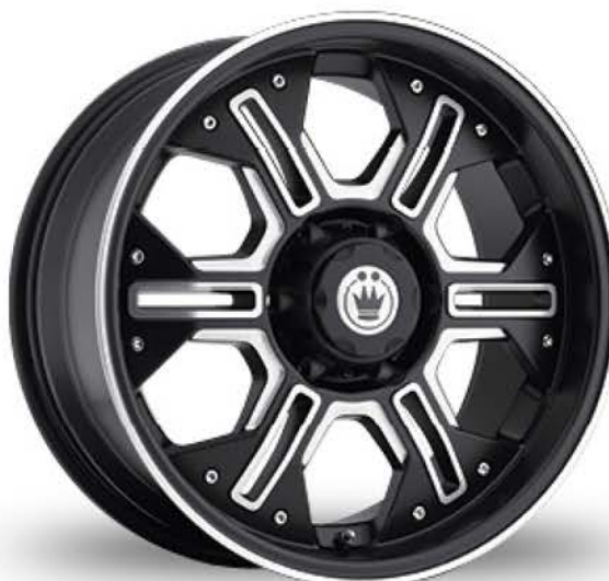
MATTE BLACK / BALL CUT MACHINED