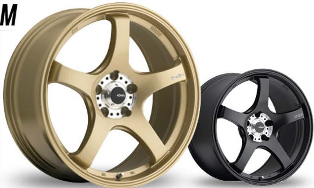
GOLD / MACHINED PCD