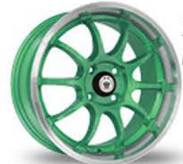
GREEN / MACHINED LIP