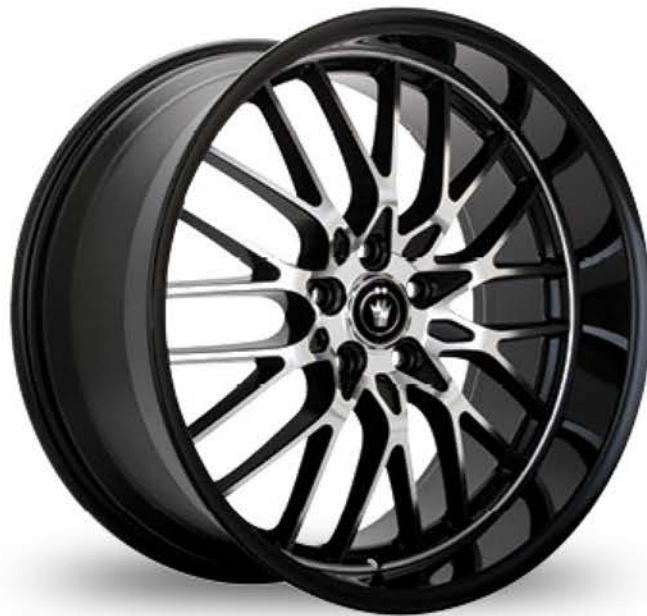
GLOSS BLACK / MACHINED FACE