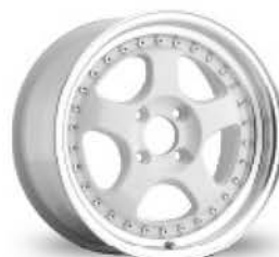
WHITE / MACHINED LIP