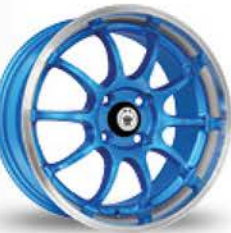
BLUE / MACHINED LIP