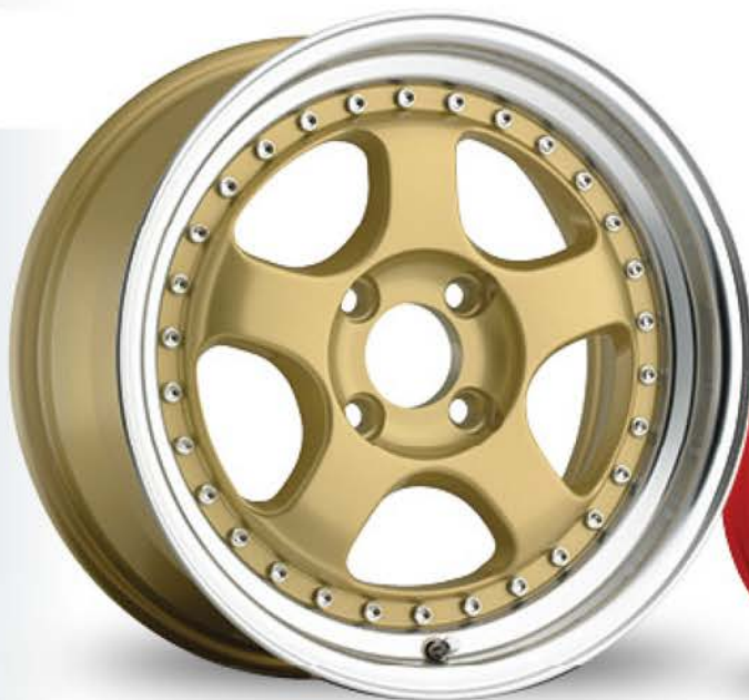
GOLD / MACHINED LIP