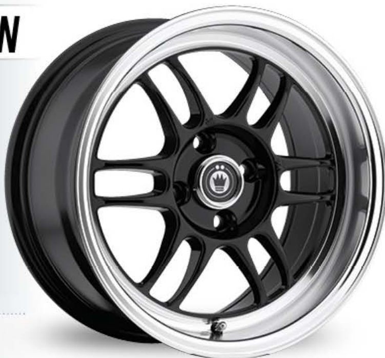
GLOSS BLACK / MACHINED LIP