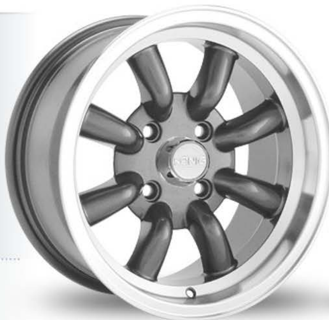
MATTE GRAPHITE / MACHINED LIP