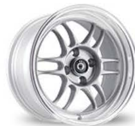
SILVER / MACHINED LIP