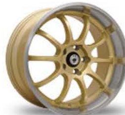
GOLD / MACHINED LIP