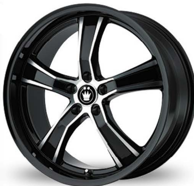
GLOSS BLACK / MACHINED FACE