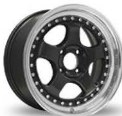
BLACK / MACHINED LIP

The CANDY offers a retro, 5-spoke design, with a 2-step machined lip and is available in four different colors, and low offsets.