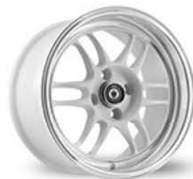
WHITE / MACHINED LIP