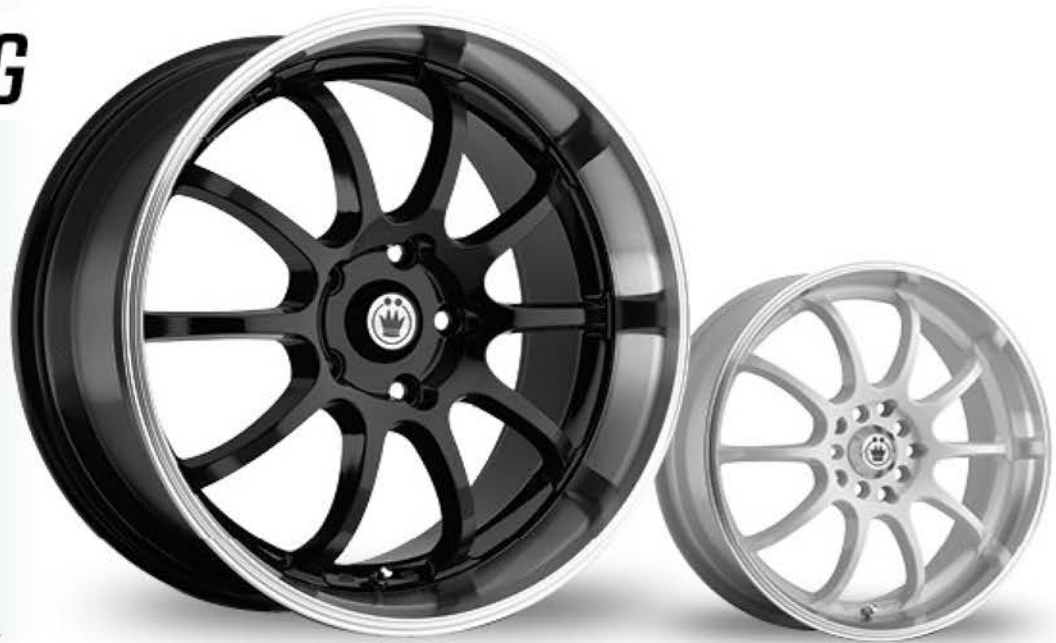
BLACK / MACHINED LIP