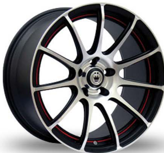
MATTE BLACK / MACHINED FACE / RED UNDERCUT