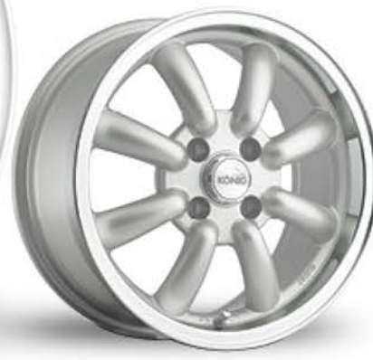
SILVER / MACHINED LIP