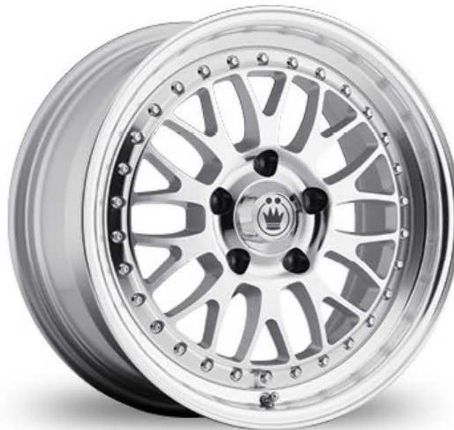
SILVER / MACHINED FACE