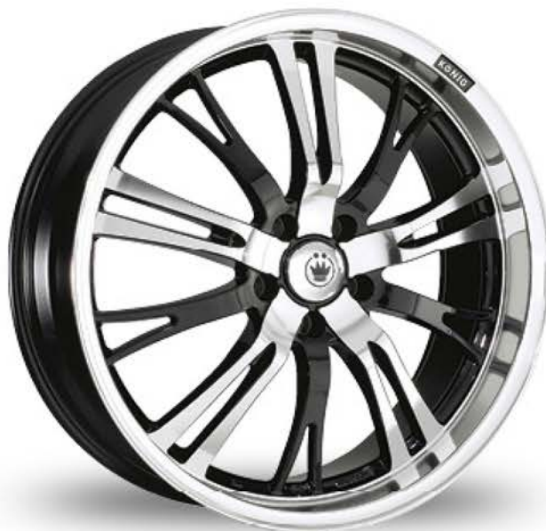
BLACK / MACHINED FACE