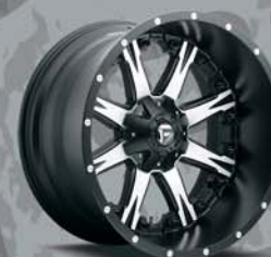
d-541 BLACK & MACHINED 22x12