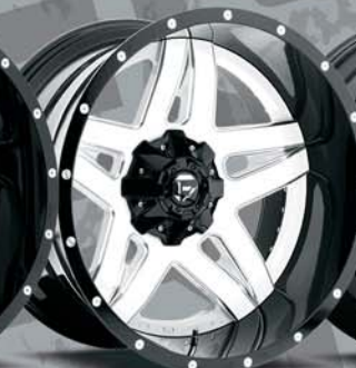
d-255 GLOSS WHITE & MILLED