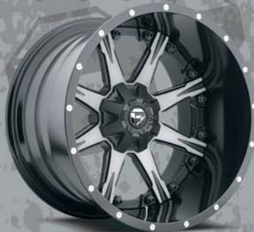
d-252 BLACK & MACHINED, DARK TINT

maverick patents D680049, D680940 SIZES: 20x10, 20x12, 20x14, 22x10, 22x12, 22x14, 24x12, 24x14