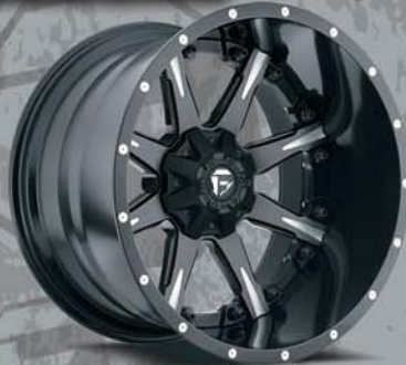
d-251 BLACK & MILLED

nutz patents D680936, D686958 SIZES: 20x9, 20x10, 20x12, 20x14, 22x10, 22x12, 22x14