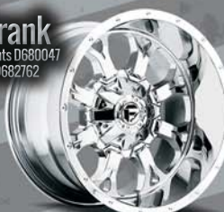
d-516 CHROME 20x12