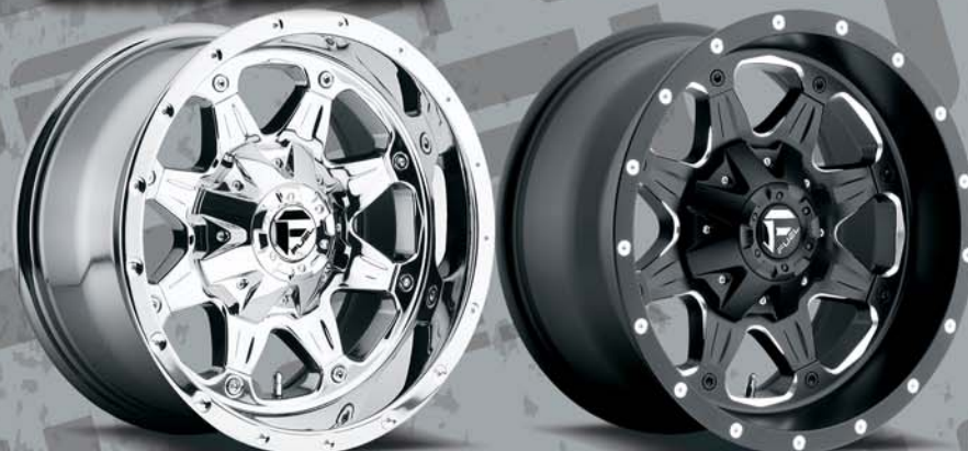
d-533 PVD 17x9, 17x9 DL, 18x9, 18x9 DL 20x9, 20x9 DL