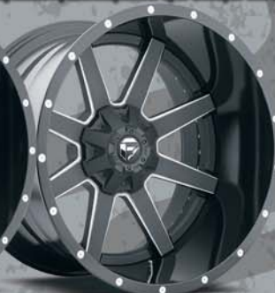
d-262 BLACK & MILLED