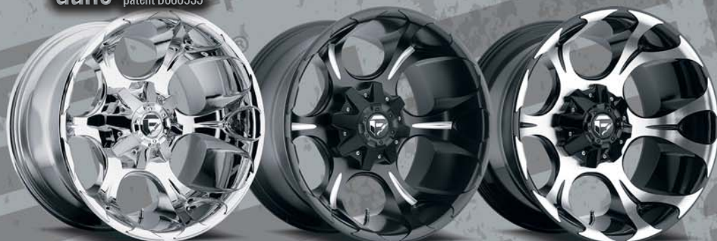
d-522 CHROME 20x12