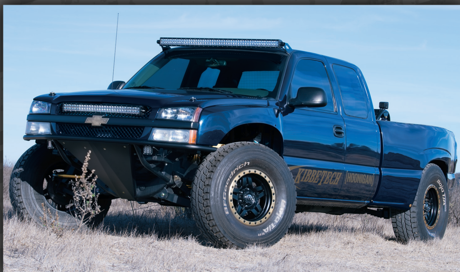
ring custom painted by customer

17x8.5, 18x9, 18x10 20x9, 20x9 DL, 20x10