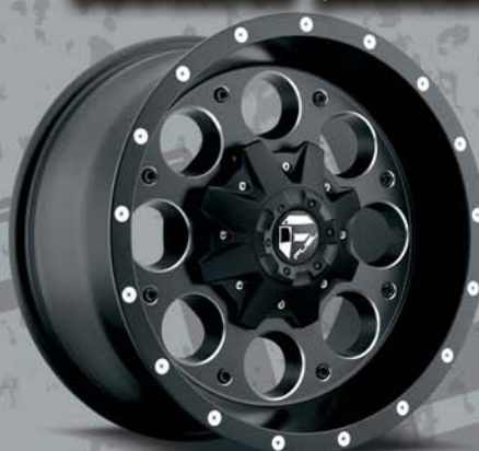
d-525 BLACK & MILLED