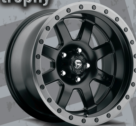
d-551 BLACK & ANTHRACITE

17x8.5, 18x9, 18x10 20x9, 20x9 DL, 20x10 22x9.5