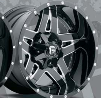
d-254 GLOSS BLACK & MILLED