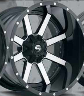
d-261 BLACK & MACHINED