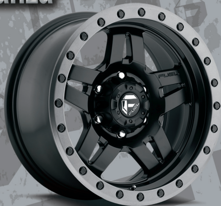
d-557 BLACK & ANTHRACITE

15x8, 15x10, 16x8, 17x8.5 18x9, 20x9, 20x10