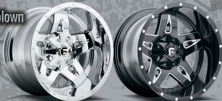
d-553 CHROME 20x12