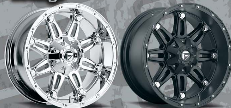
d-529 PVD 17x9, 18x9, 20x9 20x10, 22x9.5 22x11