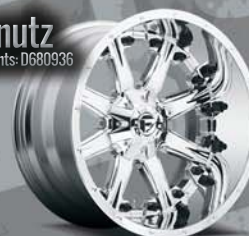
d-540 CHROME 22x12