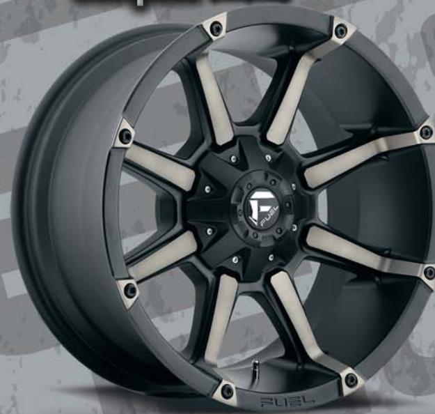
d-556 BLACK & MACHINED DARK TINT 17x9 (mid 2014), 20x9 (mid 2014) 20x10