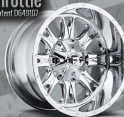
d-512 CHROME 20x12, 22x14