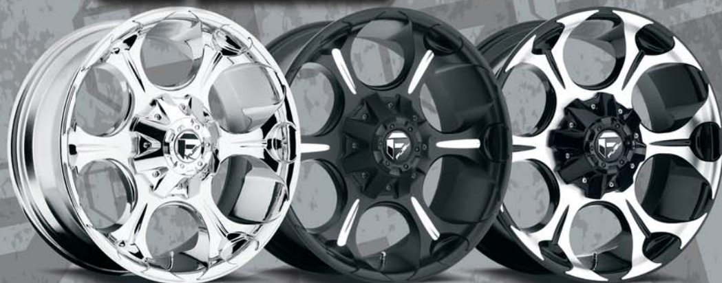
d-539 PVD 20x9, 20x10