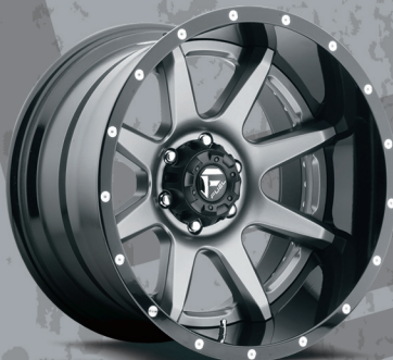
d-238 ANTHRACITE, GLOSS BLACK