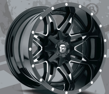
d-267 BLACK & MILLED, GLOSS BLACK