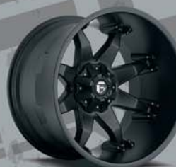
d-509 BLACK 20x12, 22x14