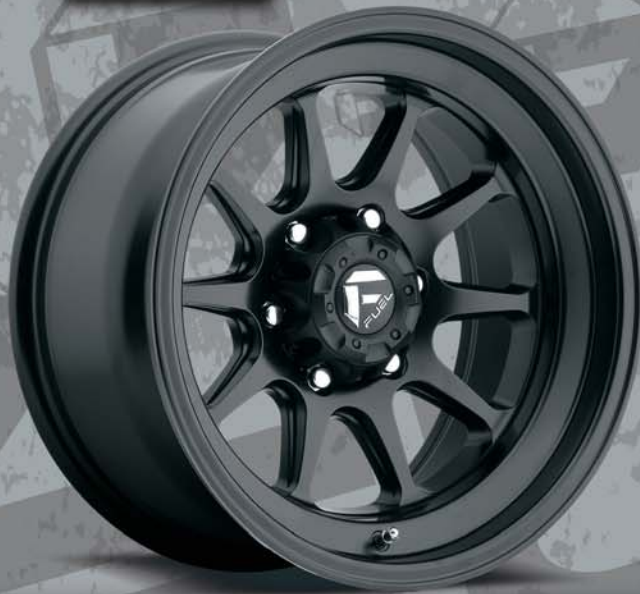
d-559 BLACK 17x9, 18x9 (mid 2014) 20x9 (mid 2014) 20x10