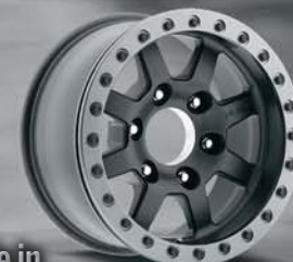
d-105 trophy offroad use only