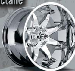
d-508 CHROME 20x12, 22x14