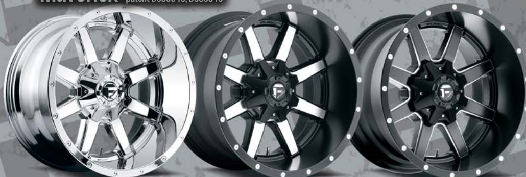
d-536 CHROME 20x12, 20x14, 22x10