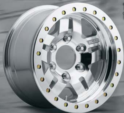
d-116 anza offroad use only

offroad use only all wheels and rings available with custom finishes