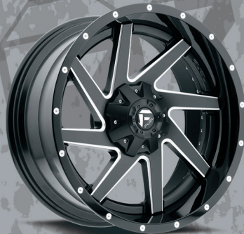
d-265 BLACK & MILLED, GLOSS BLACK