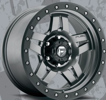
d-558 ANTHRACITE & BLACK

15x8, 15x10, 16x8, 17x8.5 18x9, 20x9, 20x10