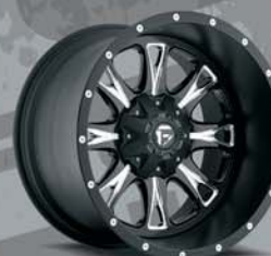
d-513 BLACK & MILLED 20x12, 22x14