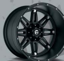
d-531 BLACK 18x12, 20x12, 20x14, 22x14