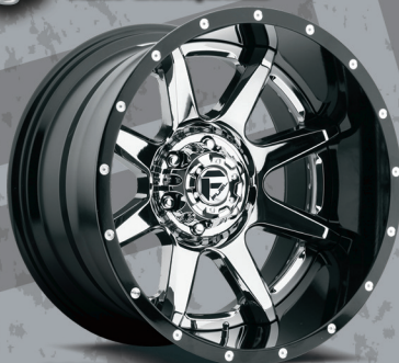
d-237 PVD, GLOSS BLACK