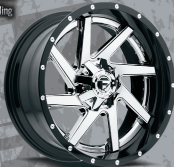
d-263 CHROME, GLOSS BLACK

SIZES: 20x10, 20x12, 20x14, 22x10, 22x12, 22x14