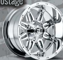
d-530 CHROME 18x12, 20x12, 20x14, 22x14