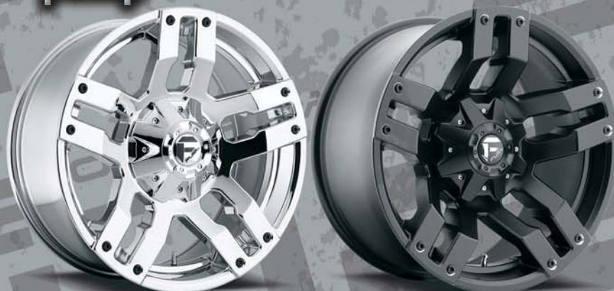
d-528 PVD 18x9, 20x9, 20x10