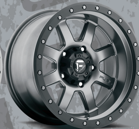
d-552 ANTHRACITE & BLACK

17x8.5, 18x9, 18x10 20x9, 20x9 DL, 20x10 22x9.5