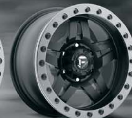
d-106 anza offroad use only