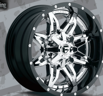
d-266 CHROME, GLOSS BLACK

SIZES: 20x10, 20x12, 22x10, 22x12, 22x14