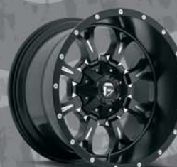
d-517 BLACK & MILLED 20x12