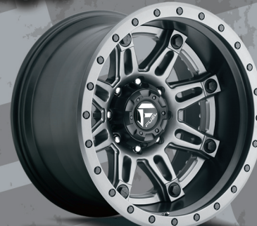
d-232 ANTHRACITE & MATTE BLACK

SIZES: 20x10, 20x12, 22x10 (mid 2014), 22x12 (mid 2014)