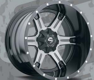
d-257 BLACK & MACHINED, DARK TINT

full-blown SIZES: 20x10, 20x12, 20x14, 22x10, 22x12, 22x14